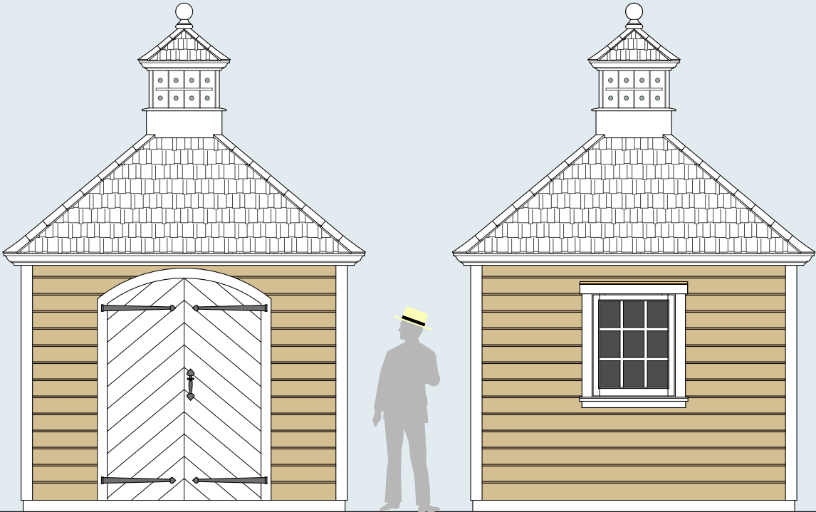
Front Elevation 9' 6" x 9' 6"

The Williamsburg Collection A GARDENSHEADS® EXCLUSIVE