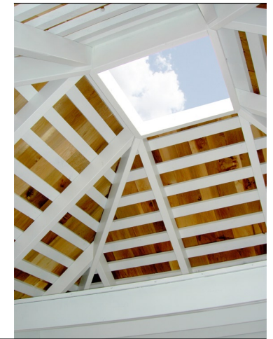
Painted Roof Lathing Underside