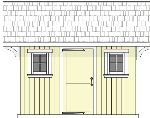
Front Elevation - 12'